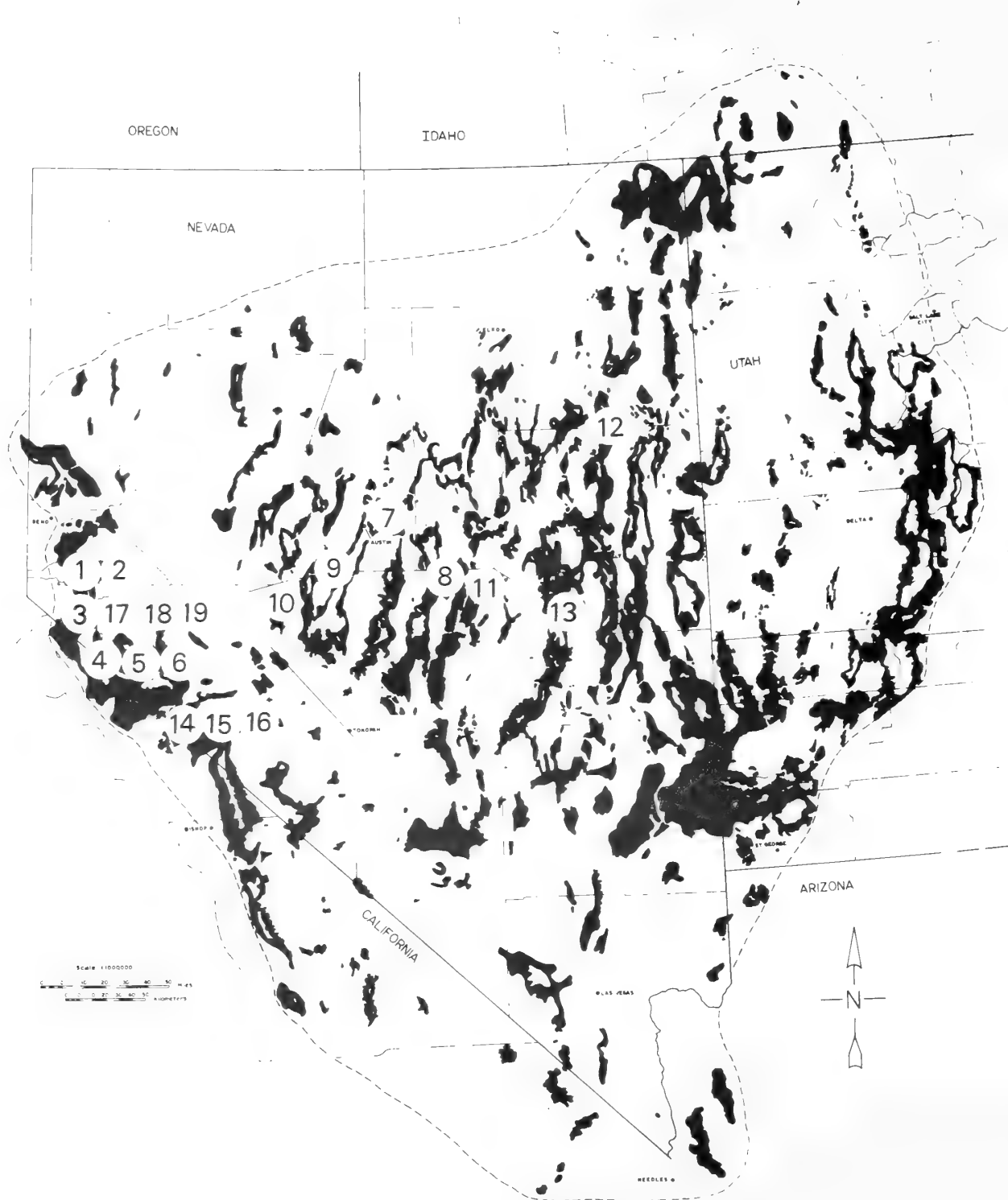
Figure 2.--Geographic distribution of study plots. This map shows the pinyon-juniper woodlands in the Great Basin and pinpoints the location of 19 study sites. (Derived from ERTS-I photography, Beeson 1974.)